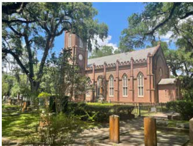
Grace Episcopal Church

A highlight of the symposium weekend is the cocktail party honoring our speakers. It will be held at Grace Episcopal Church. Experience the serenity of the grounds and cemetery at 11621 Ferdinand Street.